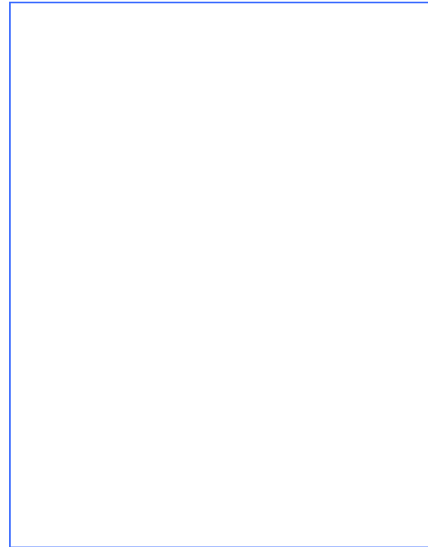
Observations with light at different angles