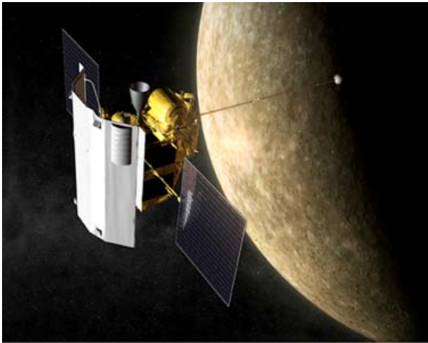
Artist's drawing of MESSENGER spacecraft orbiting Mercury.