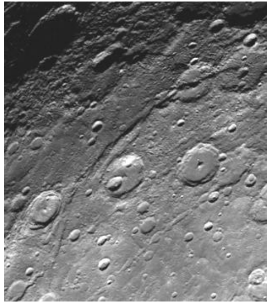
Imaging from the Mariner spacecraft of the surface of Mercury showing the circular depressions of impact craters.

Mercury may have polar ice caps! Earlier missions collected radar images of the polar regions that suggest ice at the poles. MESSENGER will help scientists answer this question.