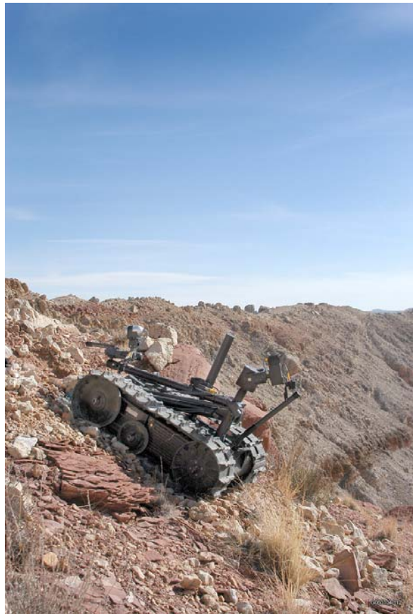
Fig. 2. Field mobility test at Meteor Crater of a terrestrial precursor of Lunar Surface Explorer. This design takes advantage of heritage developed by Foster-Miller for their Talon-series of rovers.