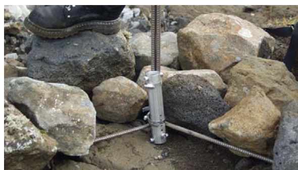
Figure 1 (top). A gully in the Tindastóll range in northern Iceland. Note the snow-filled alcove and channel, the levees, and the debris apron in the foreground. Figure 2. A temperature sensor deployed on bedrock on the floor of a gully on Ármannsfell.