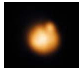
Figure 1: IRTF 3.8 micron image of Io during the November 1999 Tvashtar eruption.

The other type of observation takes place while Io is in sunlight. This enables us to observe a variety of longitudes and to look for major eruptions over the entire moon. During these observations Io's brightness is mostly due to reflected sunlight. In 1999, an eruption at Tvashtar (figure 1) was observed by the IRTF before the Galileo spacecraft obtained a higher resolution view (Howell et al., 2001), demonstrating that major eruptions can be seen from the IRTF. Nine of the observations were of this type and seven of those nights were successful for observing. They are spaced in time in order to obtain good coverage of Io at all longitudes.