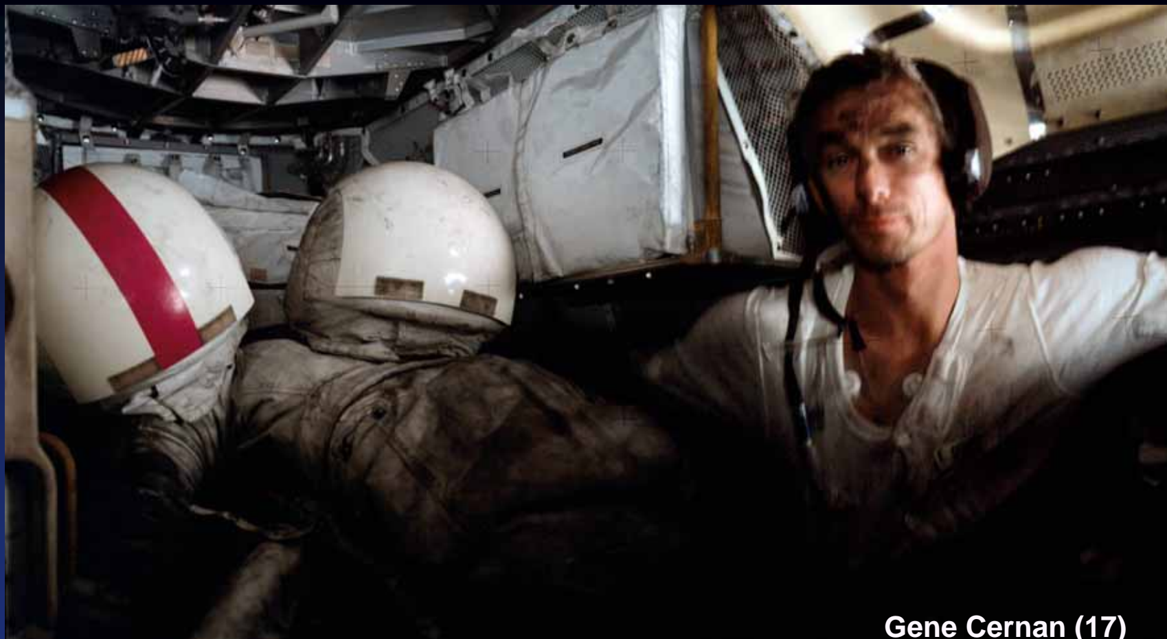
Gene Cernan (17)