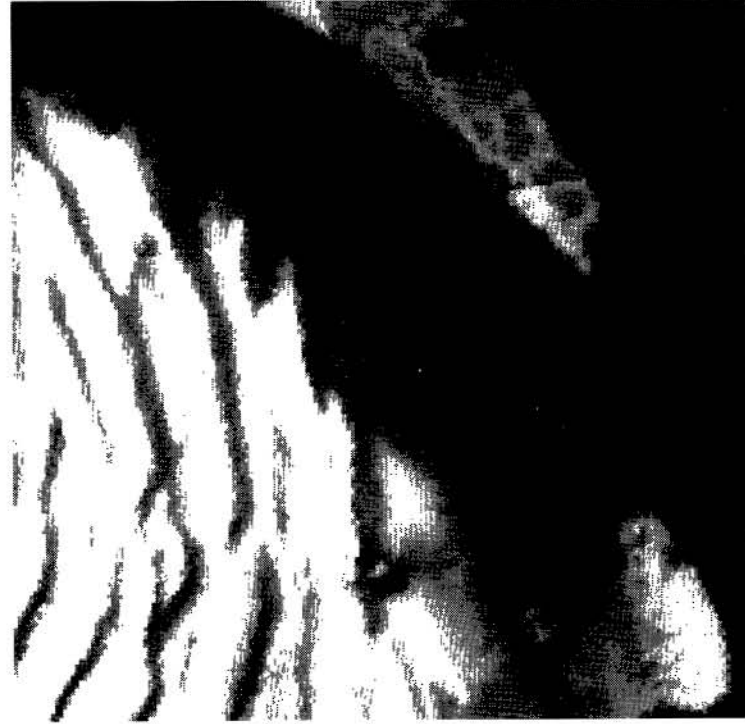
Figure 2. Viking mosaic of two images from orbits 765A ( L_S=117 ) and 801A ( L_S=134 ) in the same region as Figure 1. Mosaic polar stereographic projection centered at 82 N, 265 W. Image shows significantly more bright frost than Figure 1. Also note faint outline of frost outlier in lower right-hand corner.