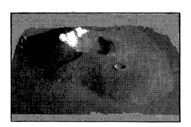
Figure 1 : 3D view of Tharsis Tholus from the south. Vertical exaggeration 10x.