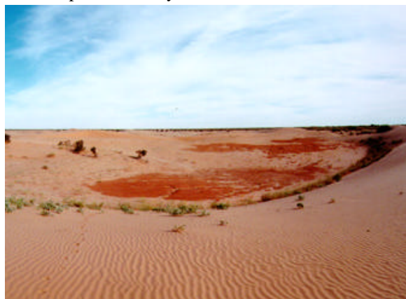
Fig. 1. Typical deflation basins showing exposed brown surfaces nearly free from vegetation and large stones.

We investigated these deflation basins in Lea County (the SE corner of New Mexico) and neighboring Winkler County, Texas following a prior search in this area which found two chondrites [4]. We found a tiny H4 chondrite in this search and here we report its mineralogy and petrology along with preliminary data on its exposure history.