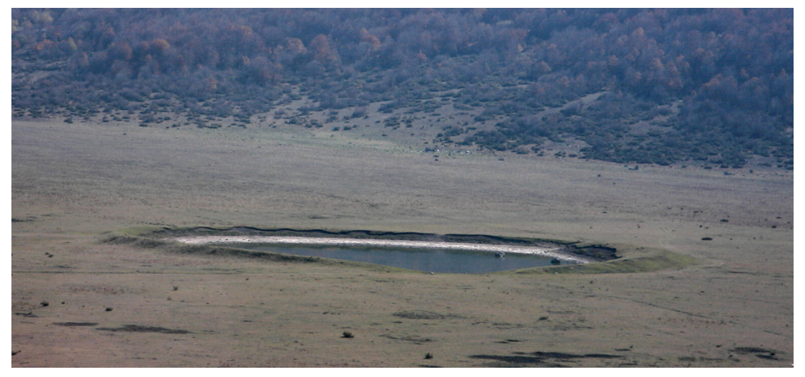
Figure 2. The Sirente main crater. The crater is about 140x115 m in diameter and has a 2.2 m high rim wall.

References: [1] Giraudi (1997) Il Quaternario , 10, 191-200. [2] Jones (1977) In: Roddy, Pepin, and Merrill (Eds.) Impact and Explosion Cratering , Pergamon Press: NY, 163-183. [3] Cassidy and Renard (1996) Meteoritics & Planetary Science , 31, 433-448.