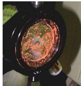
Fig. 2. Photo of main focusing optic of prototype LIBS instrument coated with dust. Even at this apparent high level of dust coating the optic, useful LIBS spectra were obtained at 3 meters.