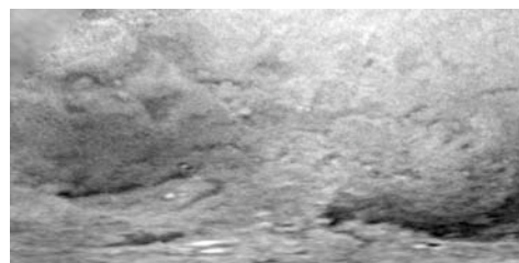
Figure 2. Dark curving lines: river channels in the S. Polar region?