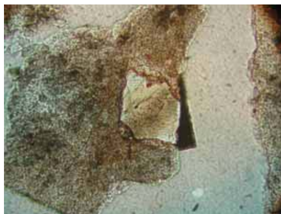
Fig.1. Microscopic photo to show shocked quartz with melt breccia at 910m in depth of Takamatsu-Kagawa district in Japan.

Summary: 1) Three types of rocks in Takamatsu-Kagawa district are found as original impact rocks, melt brecciated rocks with hydrothermal alteration and volcanic rocks. 2) Three types of shocked quartz with PDFs are found in this district. 3) These rocks are related by broken structure from original ca.8km in diameter as impact structure at volcanic islands of Japan. 4) X-ray CT images show smaller grains inside the sample.