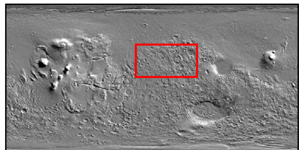
Fig. 1 Arabia Terra study area -- MOLA digital elevation model

Study Area: Arabia Terra, approximately the size of Australia, was chosen for this initial study because it is one of the three areas of enhanced methane concentration [3], and because the region includes several features potentially indicative of a past, major sedimentary basin. Arabia Terra is the northernmost extension of the cratered highlands, and is approximately bounded by 0 to 40 N latitude and 20 W to 60 E longitude (Fig. 1). The area is dominated by a regional slope, descending from +4000 m in the SE to -2500 m at the dichotomy boundary in the in the NW [12]. It has been mapped as Noachian plains with minor Hesperian ridged units [13,14].