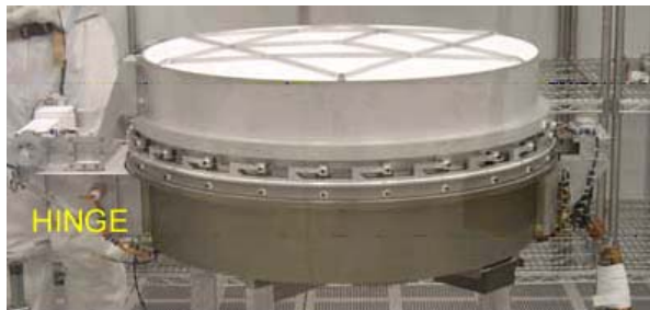
Fig. 1. Pre-flight configuration of the science canister.

Introduction: The Genesis science canister is an aluminum cylinder (75 cm diameter and 35 cm tall) hinged at the mid-line for opening (fig. 1). This canister was cleaned and assembled in an ISO level 4 (Class 10) cleanroom at Johnson Space Center (JSC) prior to launch. The clean solar collectors were installed and the canister closed in the cleanroom to preserve collector cleanliness. The canister remained closed until opened on station at Earth-Sun L1 for solar wind collection. At the conclusion of collection, the canister was again closed to preserve collector cleanliness during Earth return and re-entry. Upon impacting the dry Utah lakebed at 300 kph the science canister integrity was breached [1]. The canister was returned to JSC. The canister shell was briefly examined, imaged, gently cleaned of dust and packaged for storage in anticipation of future detailed examination. The condition of the science canister shell noted during this brief examination is presented here. The canister interior components were packaged and stored without imaging due to time constraints.