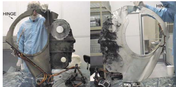
Fig. 2. Exterior (left) and interior (right) views of the science canister base, as received at JSC. Circular openings in base, beginning with largest, were sites for mounting the concentrator, filter and array deployment mechanism.

Post-recovery observations: Four significant observations were made: a) one 400- \mu m micrometeorite impact crater, b) visible areas of brown discoloration on white paint, c) printed circuit board components exhibiting plastic deformation, and d) fine black dust and coarse granulated black residue found on the base of the canister.