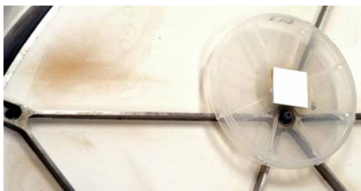
Fig. 5. Gradient of discoloration on the canister cover. The white square, sitting in a 4-inch dish, is pre-flight reference material.

Brown discoloration: Fig. 5 shows a gradient of discoloration on the canister's white painted surface. Discoloration appears around rib "shadows". Accurately mapping and analyzing the distribution of discoloration may be useful. Interior parts of the canister, which are unpainted and unanodized aluminum, also have discoloration referred to as "brown stain" which is thought to be due to UV polymerization of a hydrocarbon or siloxane contaminant [2]. However, it is unclear whether the two types of discolorations are due to related mechanisms.