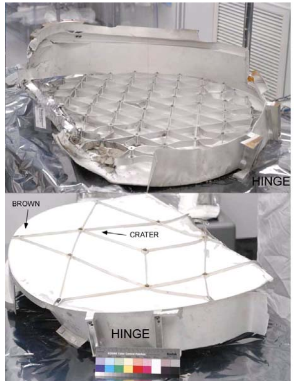
Fig. 3. Interior (upper) and exterior (lower) views of the science canister cover, as received at JSC. Arrows point to the location of the micrometeorite crater (fig. 4) and brown discoloration (fig. 5).

Micrometeorite impact: One crater, with morphology of typical micrometeorite impact craters, was observed. The crater, approximately 400 \mu m in diameter, is surrounded by a dark halo (fig. 4). The