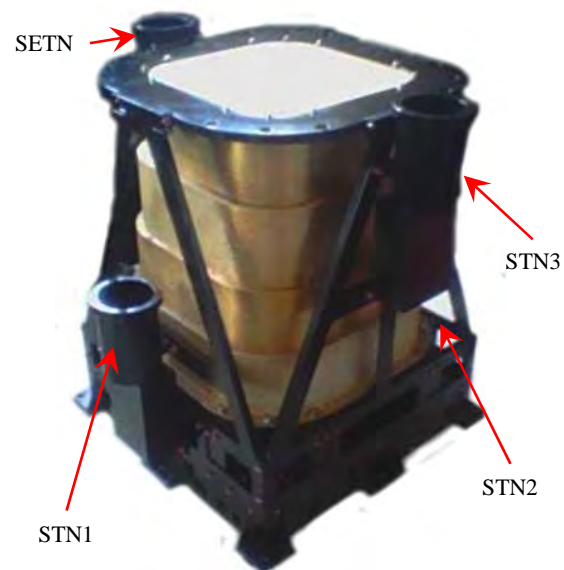
Fig. 1. The Lunar Exploration Neutron Detector. Four sensors of neutrons are shown: 2 open filed sensors of thermal (STN 3) and epithermal neutrons (SETN), 2 sensors of Doppler filter for thermal neutrons (STN 1 and STN 2). Other five sensors are inside the collimator module: 4 collimated sensors (CSETN 1- 4) of epithermal neutrons and 1 collimated sensor of high energy neutrons (SHEN).

The LEND Mechanical-Mass Mock-up was ready for mechanical testing at end of 2006. Mechanical structures for Qualification Unit and First Flight Unit of the instrument where at final stages of manufacturing.