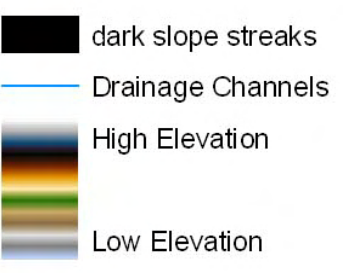
Figure 2: MOLA basemap showing the distribution of dark slope streaks on the Eastern side of Schiaparelli impact basin. The most dense population of streaks are found along channels and smaller craters. 6^{\circ} - 37^{\circ} E, 16^{\circ} S - 17^{\circ} N