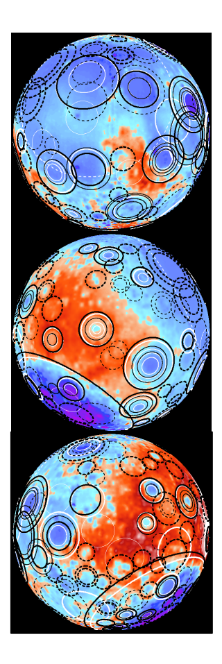
Figure 2. Equatorial views of the ULCN topography at three longitudes (0, 120 and 240W). Blues = lows, reds = highs. Wilhelms' basins > 300 km shown as white circles. His "Probable or possible basins" shown as thinner white lines. Black circles show our mapping of Wilhelms' basins derived from ULCN topography, which sometimes suggests different ring assignments and reveals the existence of many basins not previously recognized by photogeologic mapping (dashed black circles). We find at least 92 large basins compared with the 45 listed in [10].