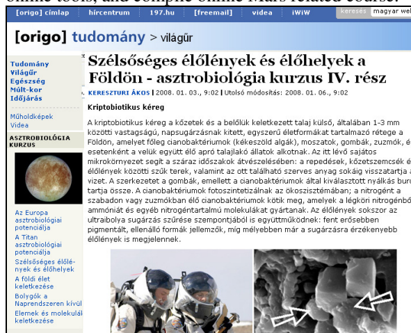
Fig. 2. Example screenshot of the website

In the next years we are to integrate astrobiology into Earth science education at university level using online tools, and compile online Mars related course.