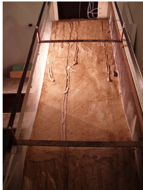
Figure 2. Close-up of the apparatus used in the physical modelling of debris flows.

Our small-scale experiment is composed of a rectangular box of 2.5 m by 0.55 m wide and 0.50 m depth filled with saturated sand and silt materials (figure 2). Morphologies are tested, with a median slope gradient of 15° whereas the top and bottom slope gradients are constant (50° and 8° respectively).