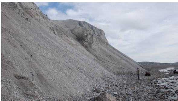
Fig. 2b. Image of the Breccia Cliff location with ~ 2 m tall person for scale. The remarkably steep slope is not apparent from the image in Fig. 2a.