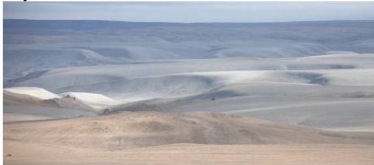
Fig. 1. This interior view of the 23 km diameter Haughton impact structure, Devon Island, Canada, shows the grey impact melt breccia deposits.

Introduction: Simulated field tests of robotic operations provide useful operational lessons [e.g., 1, 2]. The simulations, including the Slow-Motion Field Test of the Mars Science Laboratory (MSL) instrument packages in 2007 (e.g. [3]), help us to understand the role of new instrumentation (such as the use of ChemCam and CheMin). In general, earth-based field tests simulating Mars operations offer advantages over the Mars Exploration Rovers (MER) in that the interpretations can be checked for accuracy by a human field geologist, and can utilize the new instruments that will be available to MSL. A new set of rover science simulation tests using the Haughton impact crater as a test site was therefore funded by the NASA Moon and Mars Analog Mission Activities (MMAMA) program. The Haughton tests are complementary to an ambitious set of Science Activity Plan Exercises (SAPE) run by Joy Crisp at JPL utilizing MER data and the MSL software "MSLICE" to practice MSL operations. The conduct of the SAPE tests in the Fall of 2008 provided both additional lessons learned, and also a framework for use of the Haughton data set for additional tests early in 2009.