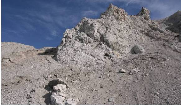
Fig. 2a. Breccia Cliff sample location. Note the lack of scale or slope information.

ysis as needed. Three specific locations were sampled for the purposes of supporting slow-motion tests.