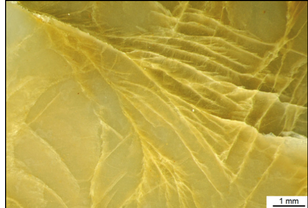
Fig. 1: Polished section of shocked chert from the Jebel Waqf as Suwwan impact structure, Jordan, showing a distinct dendritic-suborthogonal fracture network.

Jebel Waqf as Suwwan, Jordan. The investigation of a shocked, chalcedony-, quartzine-, and quartz-bearing allochthonous (Upper Cretaceous) chert nodule recovered from wadi gravels in the central uplift of the ~6 km Jebel Waqf as Suwwan impact structure [6] revealed new potential shock indicators in microfibrinous-spherulitic silica, in addition to well-defined shock-metamorphic effects [7] in coarser-crystalline quartz. Apart from the macroscopic overall brecciation of the chert, the microcrystalline silica groundmass exhibits a dendritic-suborthogonal fracture pattern (Fig. 1) commonly associated with thin silica 'recrystallization bands' that intersect the diagenetic chert fabric. Fibrous aggregates of quartzine spherulites in chalcedony-quartzine-quartz veinlets locally have shattered appearance and show conspicuous microscopic 'curved fractures' perpendicular to the quartzine fiber direction (parallel to the basal plane; Fig. 2); the curved fractures commonly trend subparallel to planar fractures (PFs) in neighboring shocked quartz. Quartz exhibits PFs, feather features [8], and mainly single sets of planar deformation features (PDFs) parallel to the basal plane (0001) (Brazil twins) [7;9] with rare additional PDFs parallel to {10 \bar{1} 3}. In contrast, autochthonous Eocene cherts from the weakly shocked uplifted rim of the Jebel Waqf as Suwwan impact structure lack PFs and PDFs in quartz, as well as quartzine and curved fractures therein [10].