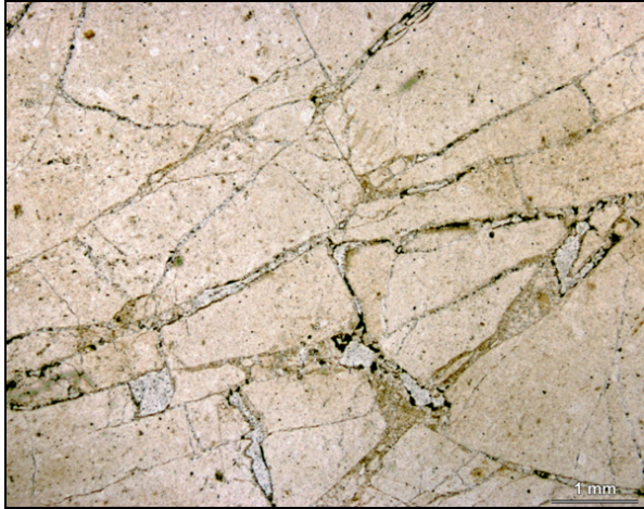
Fig. 3: Dendritic-suborthogonal fracture pattern and silica recrystallization bands in impact-brecciated chert from the Steinheim Basin, Germany (plane-polarized light).

Kentland, Indiana, USA. Carbonate-dominated polymictic lithic impact breccias from the central uplift of the ~13 km Kentland impact structure [12] contain clasts of partially recrystallized Paleozoic chalcidonic chert that show mainly single sets of PDFs in coarser-crystalline quartz domains (Fig. 4), similar to the Jebel Waqf as Suwwan cherts. Chert clasts in the impact breccia, moreover, commonly exhibit suborthogonal fracturing and silica recrystallization bands.