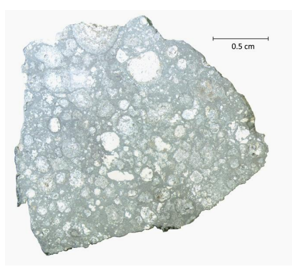
Figure 1. Allende meteorite with visible chondrules.

Scanning electron microscope (SEM) images were collected using an SEM/FIB Zeiss-Auriga Microscope outfitted with an EDAX X-ray spectrometer system at the University of Rochester's Integrated Nanosystems Center.