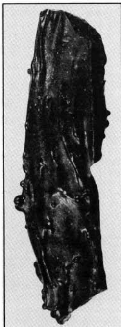
Photos 60, 61, and 62. Russian tektites (Irghezites) from the Zhamanshin Crater north of the Aral Sea. Maximum length of specimens is approximately two centimeters.