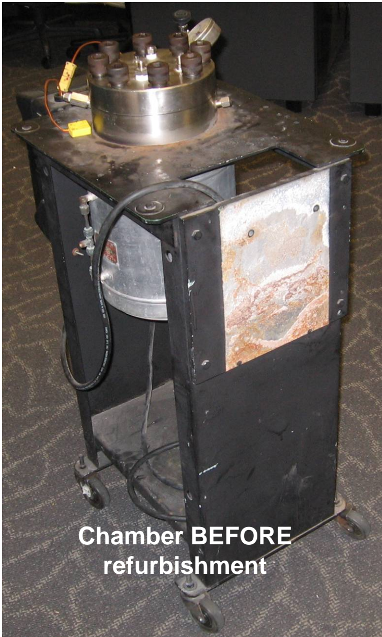
Chamber BEFORE refurbishment