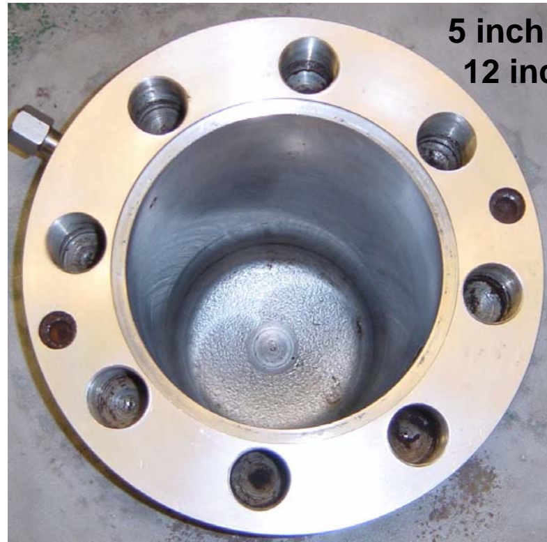
5 inch diameter 12 inch depth