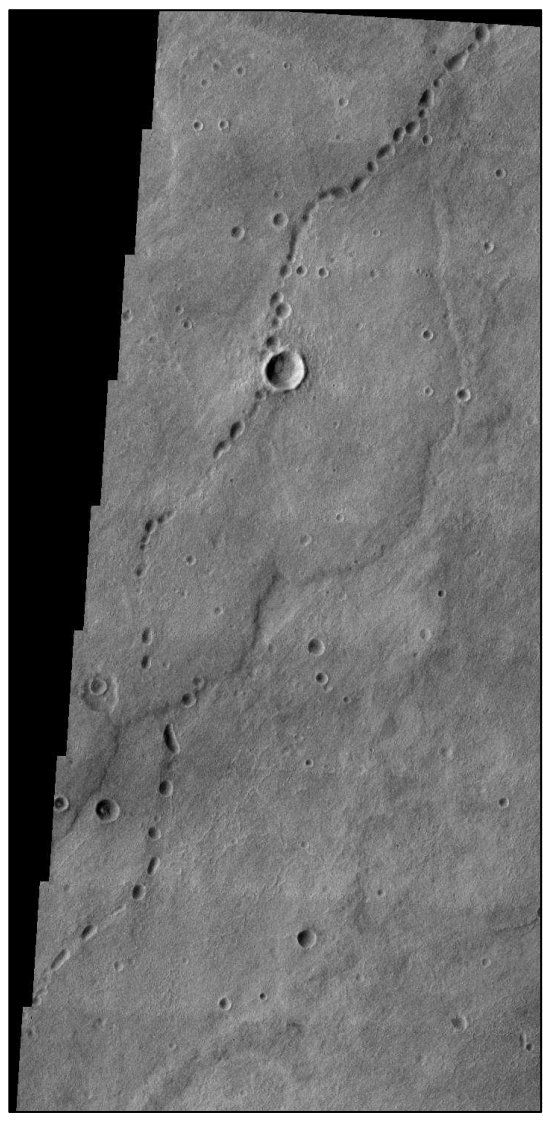
Fig 2 Possible Lava Tube on Mars. Image is from MO/THEMIS showing serial collapse pits. The sections between the pits may represent intact sections of the tube. This feature may be related to flows from Hadriaca Patera (PIA07055).

Paradoxically, while Marian lava tubes would be superb locations for astronaut habitat shelters and could well allow for the reduction of landed payload mass, exceptional pre-cautions would need to be taken. First, we would have to rule out the existence of living organisms before intruding into these pristine enclosures. Second, it is also possible that if we were to place a habitat within a lava tube, microorganisms unavoidably brought with the astronaut crews