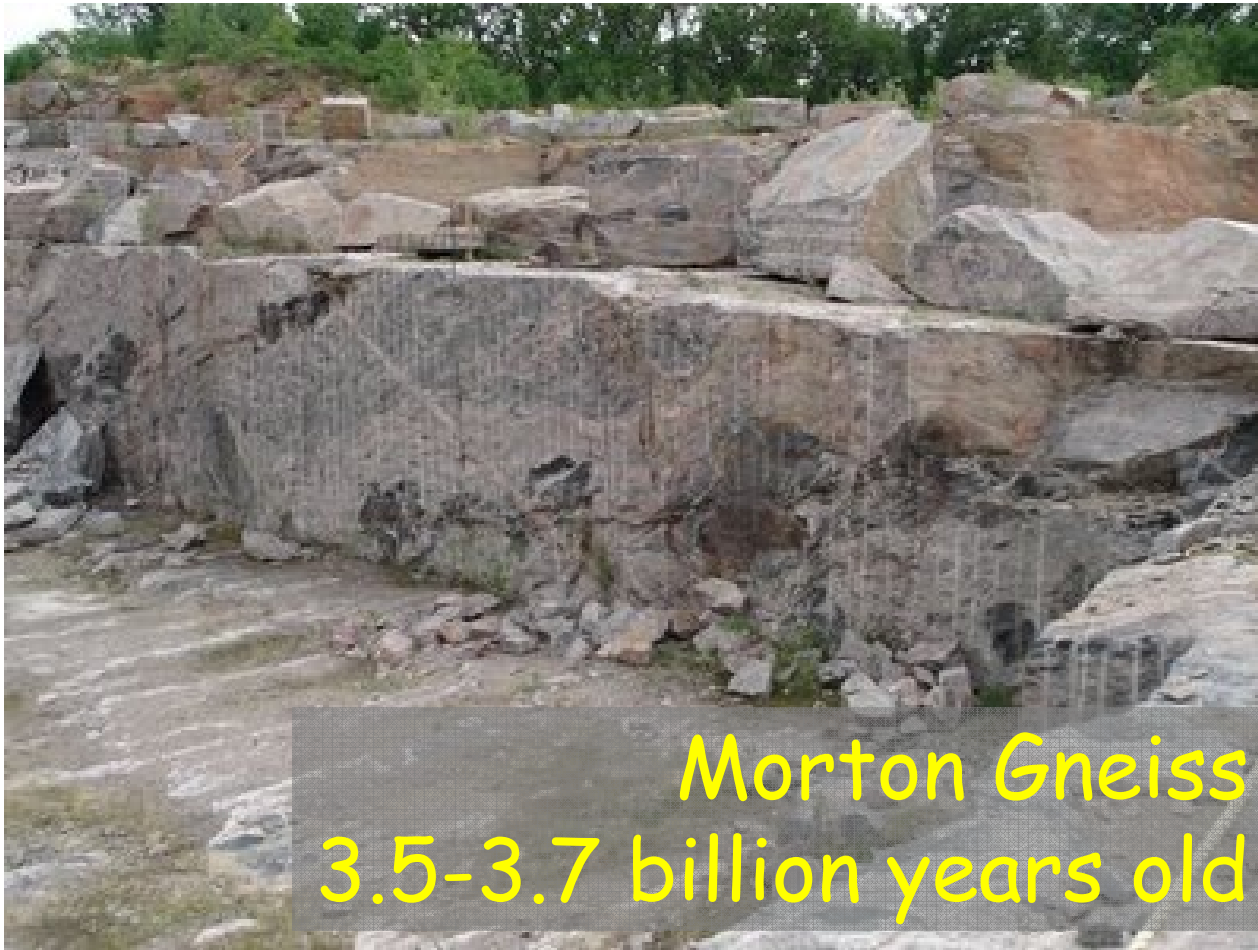
Morton Gneiss 3.5-3.7 billion years old