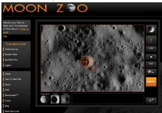
Figure 2: The MoonZoo website and graphical interface for crater identification and measurement tasks [3].

Through the MoonZoo interface, citizen scientists are presented with NAC images of the surface of the Moon and they are asked to identify and annotate a wide range of geologic features. These features include crater sizing (the main research target) and counting, identifying rills and boulder tracks. MoonZoo has access to subsets of NAC images from three different zoom levels, representing the lunar surface at a scale from metres to kilometres (Fig 2).