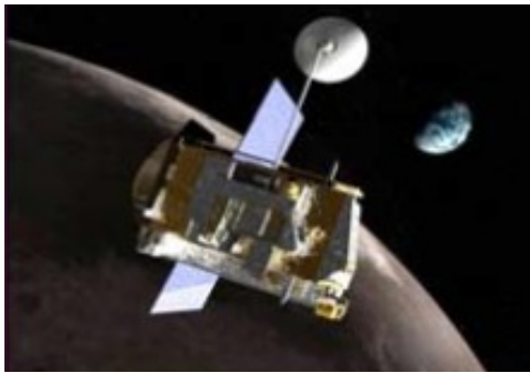
Figure 1: Lunar Reconnaissance Orbiter (NASA).

Introduction: MoonZoo is an online citizen science project, one of several of the Zooniverse Citizen Science Alliance. MoonZoo uses high spatial resolution images from the NASA Lunar Reconnaissance Orbiter (LRO) (Fig 1) [1], Narrow Angle Camera (LROC NAC) instrument [2].