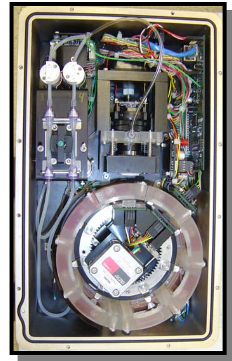
ISS Flight Prototype