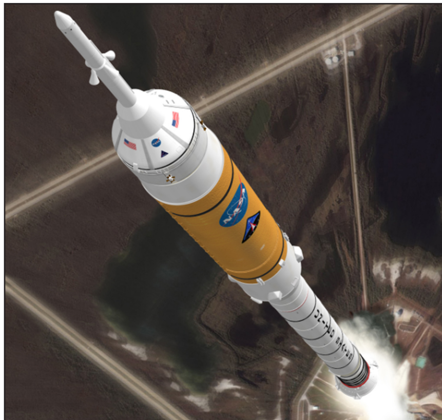
Concept image of launch of Ares I.

The combination of the rocket's configuration and Orion's launch abort system, which can move astronauts away quickly in case of a launch emergency, will improve crew safety.