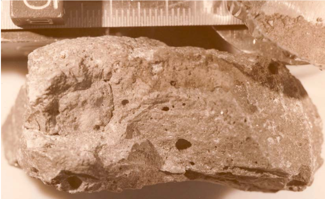
Figure 1: Another view of 60235. S79-39951. Cube is 1 cm.