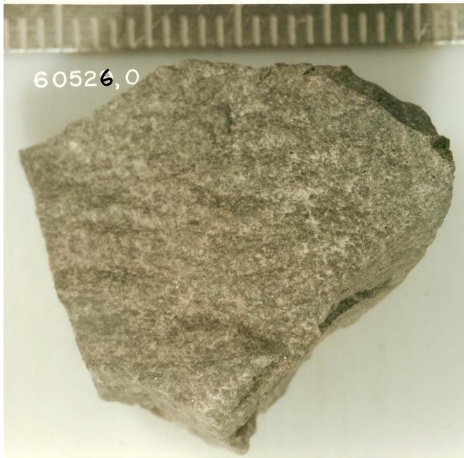
Figure 1: The portrait of KREEP. Sample is 2 cm across. S72-46332