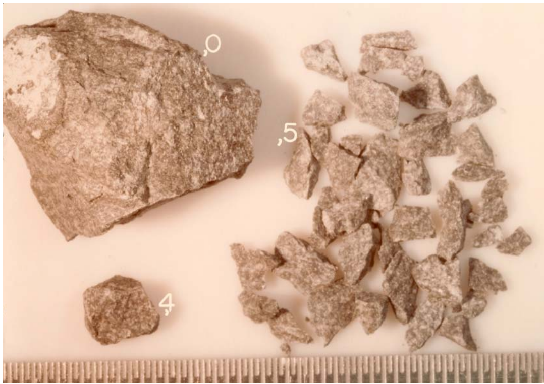
Figure 4: Processing photo of KREEP. Scale is metric with half mm ticks. S78-27394