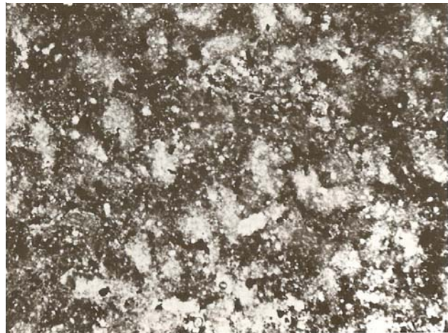
Figure 2: Thin section photo of 60526 (from Warner et al. 1976). 2 mm across

technique (a) broad beam e prob, (b) some sort of average inc. 60526