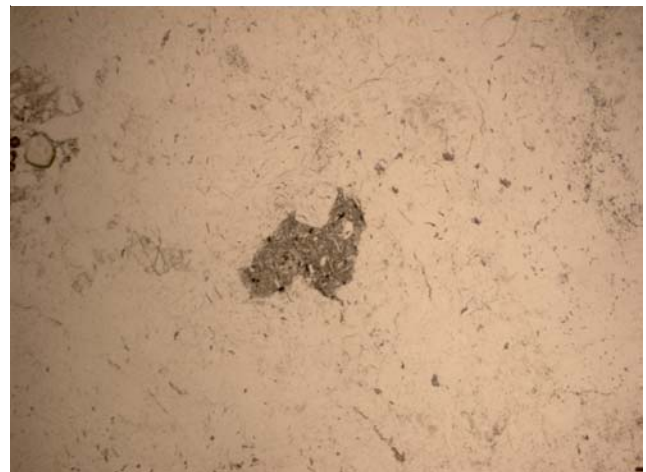
Figure 2: Phot of thin section 60629,2 showing shocked plagioclase with trapped melt inc. 2 mm

The black glass attached to 60629 was analyzed by See et al. (1986) and Morris et al. (1986).