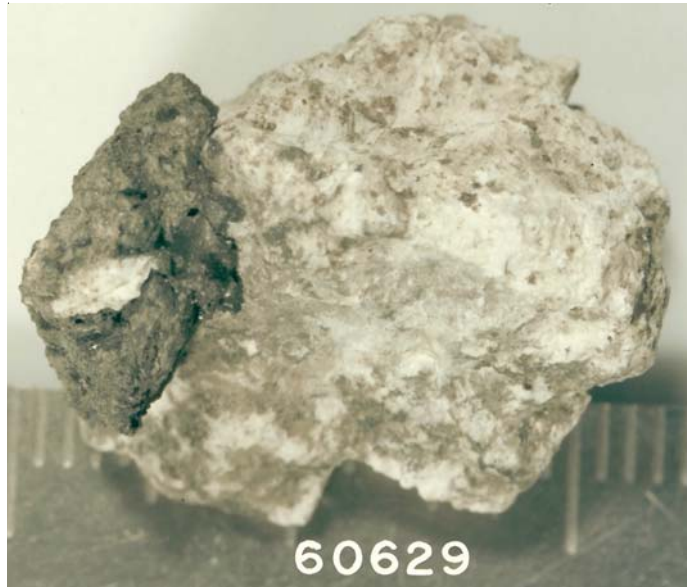
Figure 1: Photo of 60629 showing black glass attached to anorthosite. Scale marked in mm. S73-20484