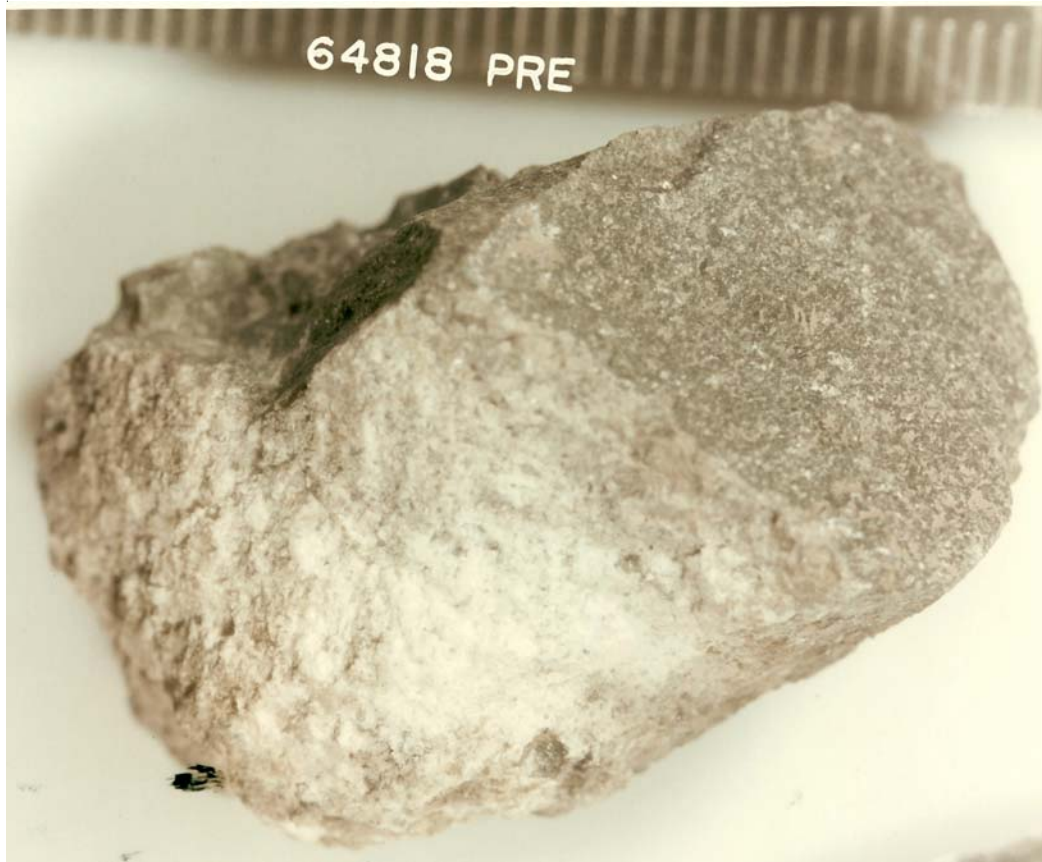
Figure 1: Photo of 64818. Scale is marked in mm. S72-55338