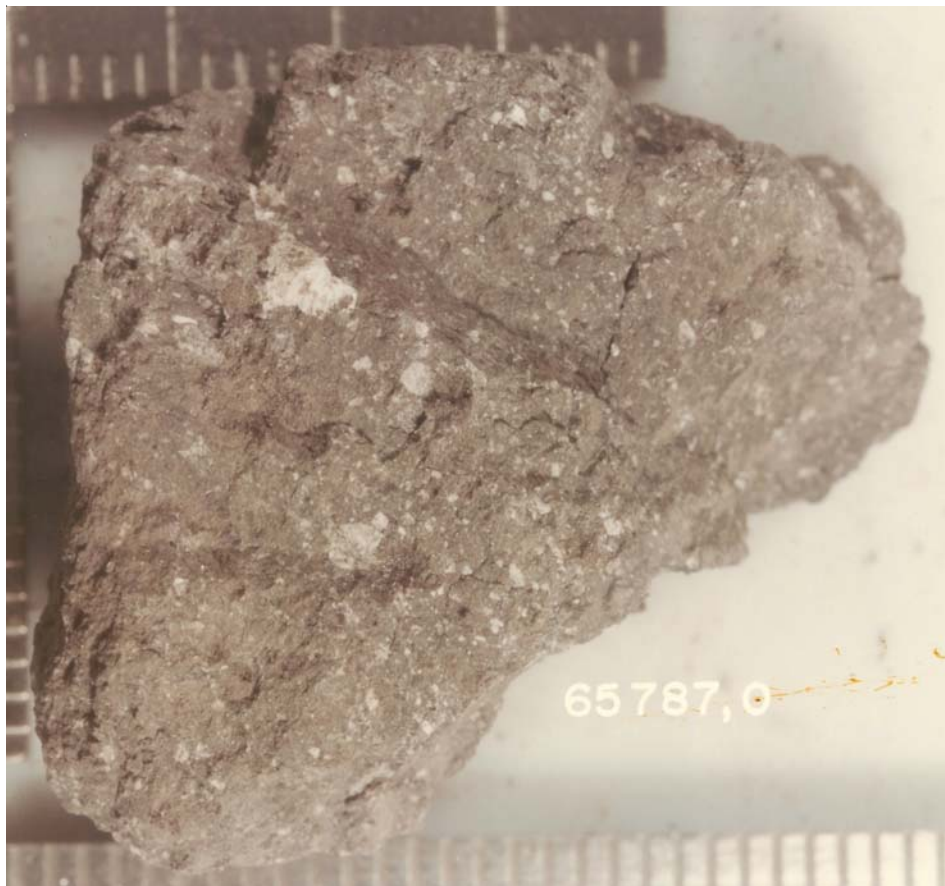
Figure 2: Photo of 65787 with mm scale. S72-48814