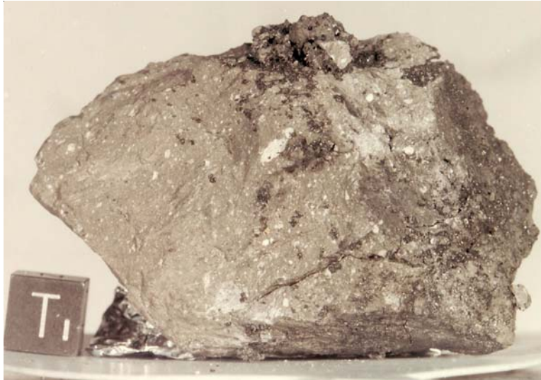
Figure 1a: Photo of 65786. Cube is 1 cm. S72-43403

65786 – 83 grams 65787 – 8.3 grams Glass-matrix Breccia