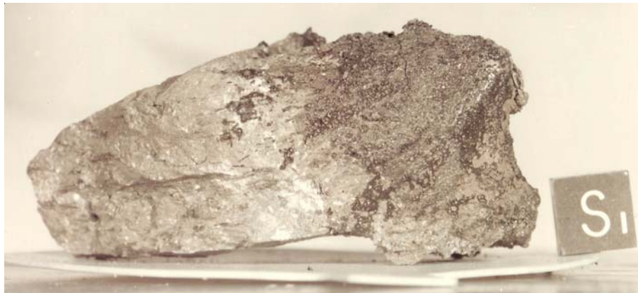
Figure 1b: Photo of 65786 showing glass coating. S72-43415