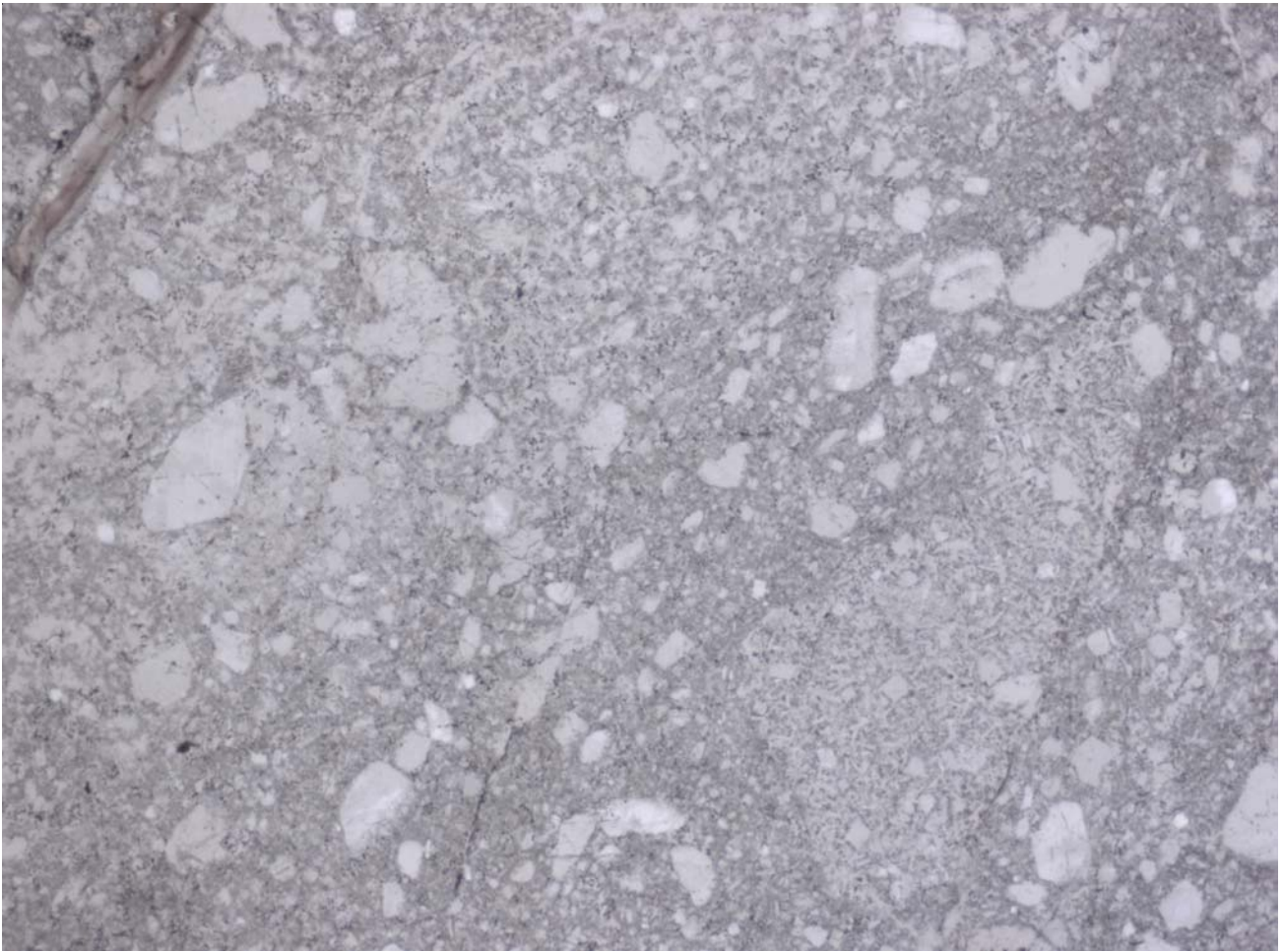
Figure 3: Photomicrograph of thin section 67947,3. 2 mm across