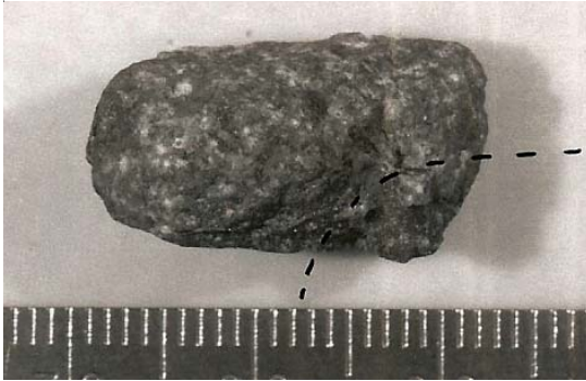
Figure 1: Photo of 68845. 2.2 cm long