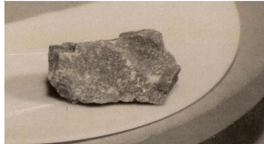
Figure 2: Photo of 68846. About 1 cm