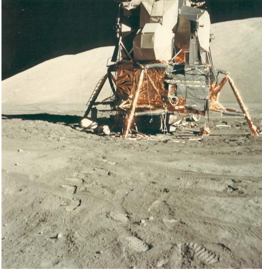
Figure 1: Photo of Apollo 17 Lunar Module (LM) showing smooth terrain of landing site. ASI7-137-20873.