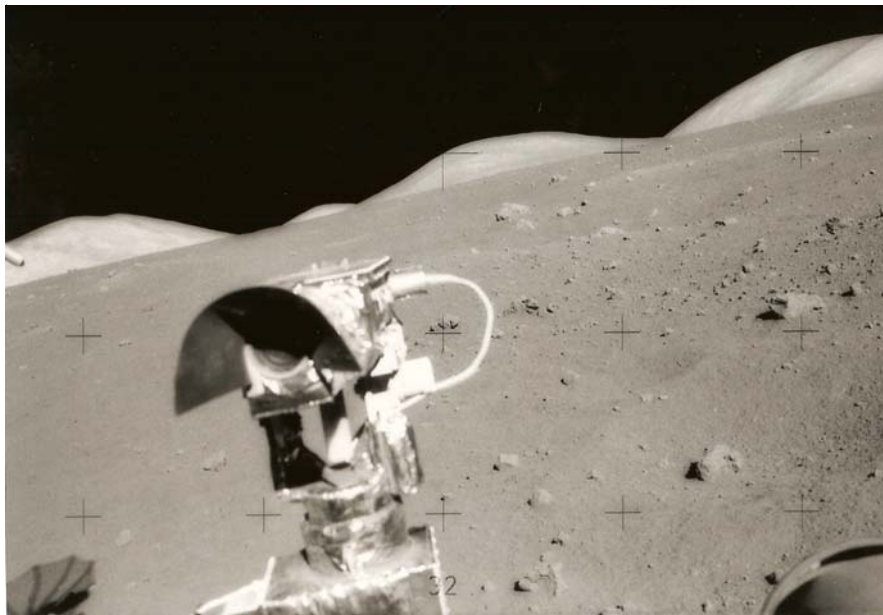
Figure 2: Location of 72135. AS17-135-20625