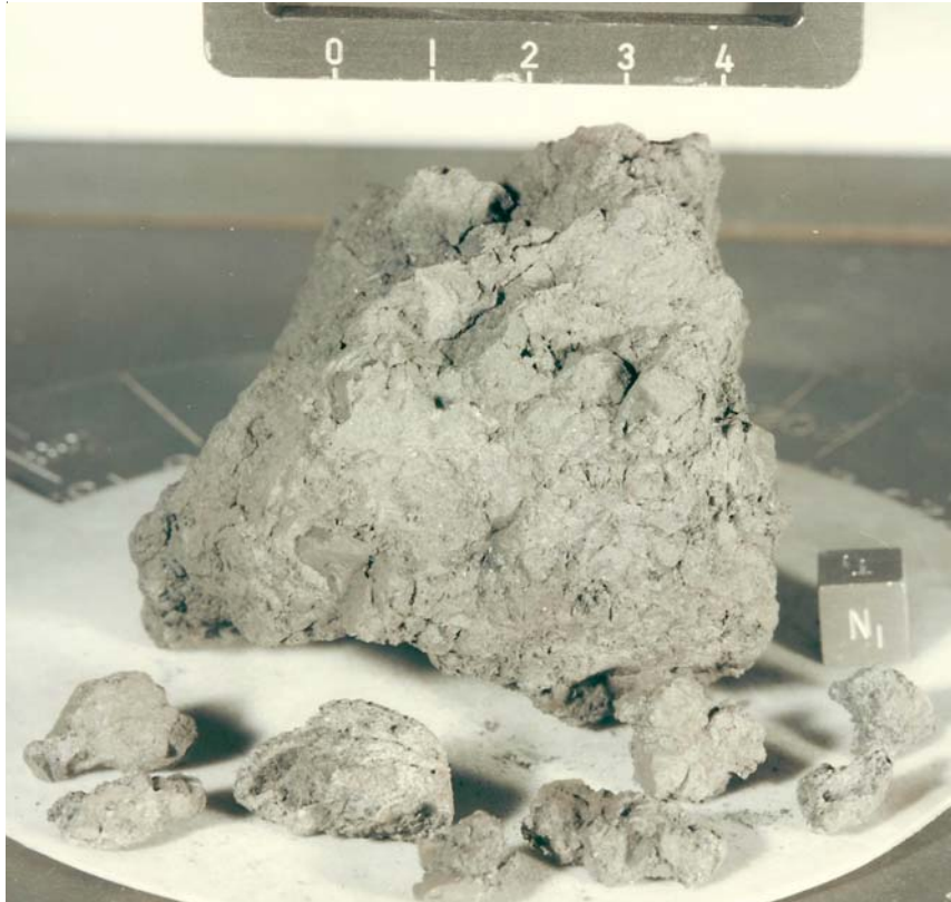
Figure 1: Photo of 72135. S73-16201