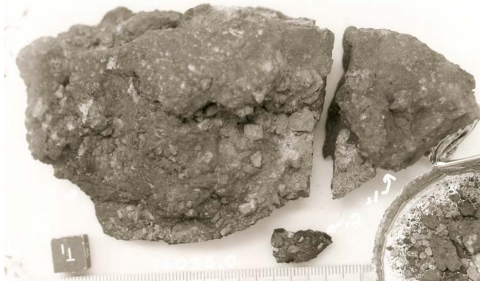
Figure : Photo of reverse side of 76036 showing small cubes of some other material. (also in cup). Cube is 1 cm. S74-22041.