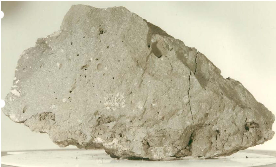
Figure 1: Photo of freshly broken surface of 76035. Sample is about 10 cm across. S73-15455.