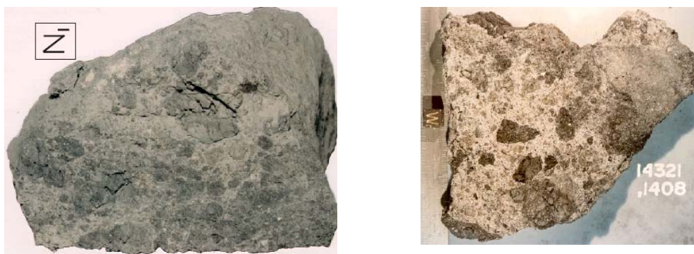
FIGURE 2. Photographs of 14321,0 "Big Bertha" and cut surfaces illustrating diverse dark clasts embedded in a light breccia matrix.

Sample containers contributed to the overall mass of material returned from the Moon during Apollo. A catalog of Apollo lunar surface geological sampling tools and containers was prepared by Allton (1989). A subset of the dimensions and weights of Apollo sample-return containers are shown in Table 2. The Apollo Lunar Sample Return Container (ALSRC or rock box) was an aluminum box with a triple seal. Two ALSRCs were used on each Apollo mission. Two 4-cm drive tube core samples were sealed in a Core Sample Vacuum Container (CSVC) on the Apollo 16 and Apollo 17 missions. Special Environmental Sample Containers (SESC) were designed to ensure that samples were not exposed to