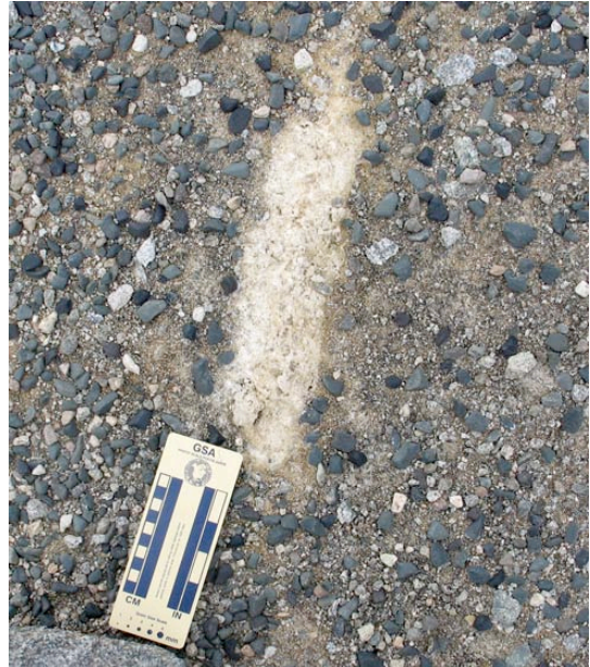
Fig. 7. Salt vein in colluvium in distal reaches of slope streaks.