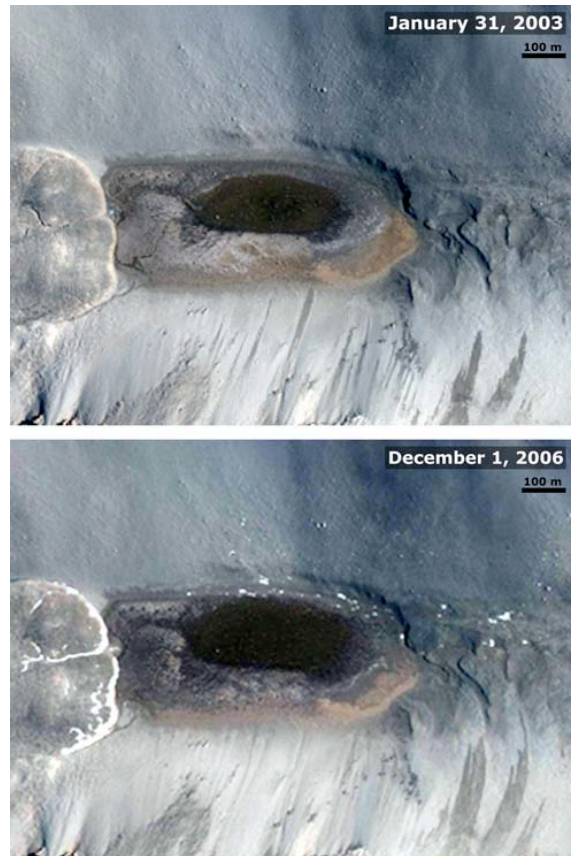
Fig. 4. IKONOS images, showing differences occurring over a three year period.