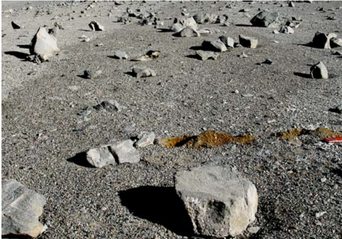
Fig. 5. ADV slope streak from the ground, looking up-slope. Two pits were dug: one in the streak (left) and one outside of the streak (right). Note that the excavated soil within the streak appears more moist and clumpy than soil excavated outside the streak. Field notebook for scale.