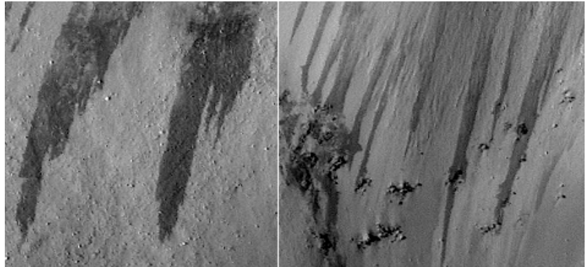
Fig. 2: Slope Streaks in the ADV; Left: digitate streaks, image width 220 m; Right: parallel streaks and effect of local topography at lower left; image width 260 m. Slope is 20-30°, top to bottom.