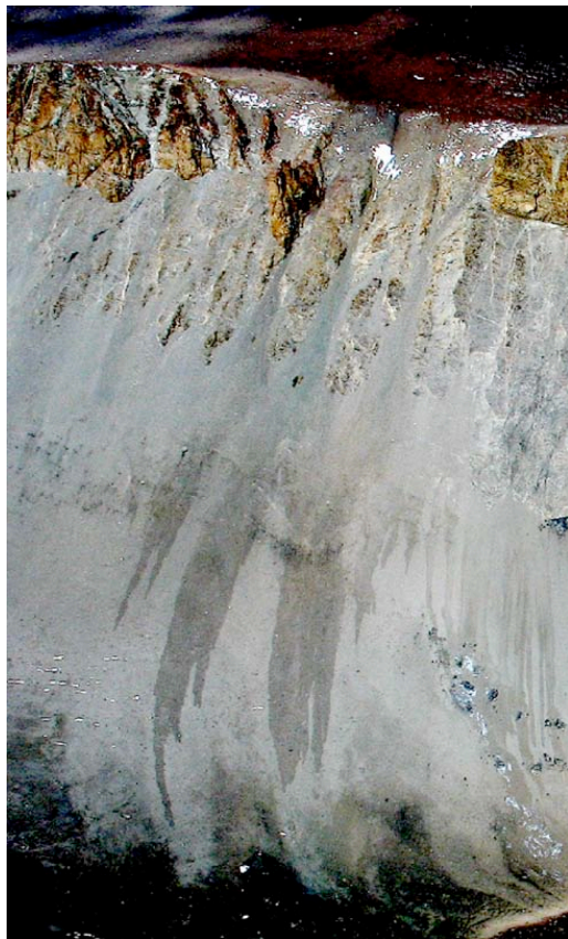
Fig. 3. Slope streaks on the south wall of Wright Valley. Note snow patches in alcoves.