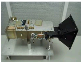
Figure 1: LAMP instrument prior to LRO integration.

LRO's polar orbit provides repeated observations of PSRs, enabling accumulation of UV signal with the photon-counting LAMP instrument over these locations. Lyman- \alpha albedo maps obtained during the nominal ESMD mission and part of the first SMD mission phase (Sept. 2009 to Feb. 2011) are shown in Figure 2 for the north and south poles.