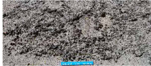
Figure 2: Patterned soil crust east of Baker, CA.

Search for Life: One of the biggest problems in the search for life on other planets, such as Mars, is where to start looking. In any environment where life once existed but now is rare or gone, that life would most likely have gone through a period of limited resources. Even in catastrophic events, not all life dies instantly, but rather many individuals and communities struggle on and leave a final trace of their efforts to survive. In isolated environments, like cave systems, organisms would be less effected and thus live longer. Further, their bio-signature would be better protected than in a more open environment like the planet surface. Caves thus recommend themselves as an ideal environment to look, but the principles outlined here also apply to a wider environment. On any planet which had extant life at one point in its history, but now may have only scarce or fossil life, life probably has exhibited patterned growth. This implies that a reasonable search