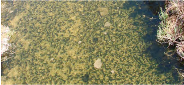
Figure 1: Patterning in Salt Creek, Death Valley.