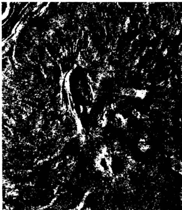
Fig. 1. a) Venera 15/16 mosaic of Colette Patera and environment. Width of image is 520 km. b) Structural sketch map. Solid lines—ridges/scarps; dotted lines—grooves; dashed and dotted lines—unclassified lineaments.