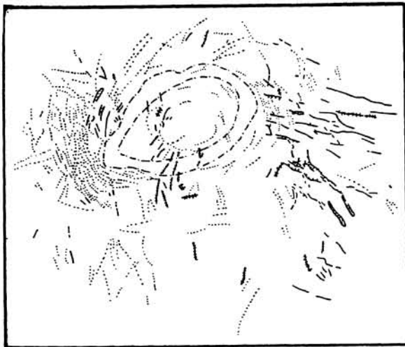
Fig. 2. a) Venera 15/16 mosaic of Sacajawea Patera and environment. Width of image is 470 km. b) Structural sketch map. Solid lines—ridges; dotted lines—unclassified lineaments; dashed and dotted lines—uncertain caldera boundary; lines hachured on one side—scarps; lines hachured on both sides—grooves