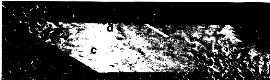
Figure 3. Area of the 1.0\ \mu\text{m} ferrous absorption bands of Syrtis Major calculated from ISM data. A simple straight line continuum was fit to the reflectance data and the area is the sum of the difference between the continuum and the spectra. Note that the materials along the topographic axis of Syrtis Major contain the strongest absorptions and the eastern part of Syrtis Major has weaker absorptions than the western part. Data dropouts are indicated as the bright rectilinear areas.