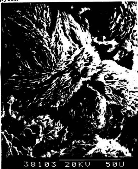
Fig. 3: Scanning electron photomicrograph of authigenic clay from 122m depth in the M1 core. Morphology and energy-dispersive X-ray analysis indicates an Mg- and Fe-rich mixed-layer clay.

materials of the Ries Crater, Germany [2], [3], and [4]. Shocked quartz, feldspar, and biotite are noted in varying degrees of abundance within breccias of the M1 core: remnant grains of recrystallized quartz typically contain a central pore. X-ray diffraction analysis of laminated, pyritic, black shales (interpreted to be displaced Proterozoic Nonesuch Shale) from the M1 core indicates that minimal, if any, graphitization has occurred.