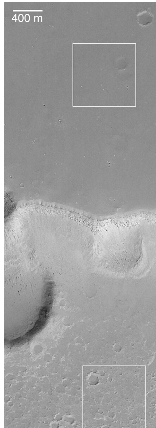
Figure 2. Cratered valley floor emergent from beneath layered wall within volcanic plains. Wall materials are known from context to include lava flows. Weathering of the dense, layered rock produces boulders. The upper layer appears smooth and is interpreted to be mantled with fines. Figure 3 subframes shown as boxes. (MOC image SP1-21903 near 24.4°N, 206.4°W).