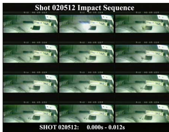
Figure 2. Impact sequence of shot 020512

Rubble Pile Impact The last specimen to be impacted was that of the aggregate, and was catalogued as shot 020512. This body consisted of six individual pieces of porphyritic basalt that were each attached by strings and held together by a small contact force induced by the displacement of the strings from a vertical axis. Each piece was weighed separately, with the total weight coming out to be 56.40 g. The speed of the projectile was measured to be 5.46 km/s, giving the impact an E/M_T of 1.2 \times 10^4 J/kg. The projectile was aimed at the largest of the individual fragment pieces. Again the video footage demonstrates the containment of the disruption to the fragment that was directly impacted. The footage is similar to that seen for shot 020511, with an even larger accentuation