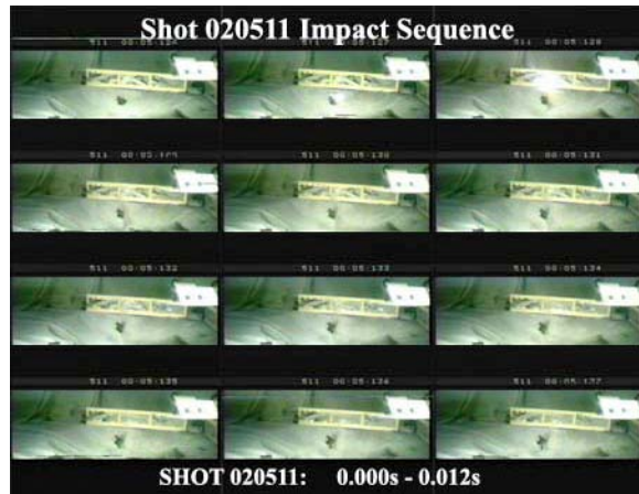
Figure 3. Impact sequence for shot 020511

impact to the fractured piece. In the video, the ejecta of smaller fragments almost completely originates from this smaller fractured piece. Upon collection of the debris, it was found that 98.71% of the original mass was retrieved. By then weighing the largest surviving piece of the target at 92.552 g, we were able to establish that 79.38% of the specimen that had not been directly impacted had remained intact.