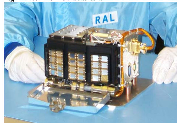
Fig 1 The D-CIXS instrument

It is based on a new negative resist that mainly consists of an epoxy resin which can be exposed using ultra violet radiation. This resist has been designed for very thick layers and has very good mechanical properties and more importantly can be used to produce features that have very good sidewall angles approaching 90 degrees and high aspect ratios.